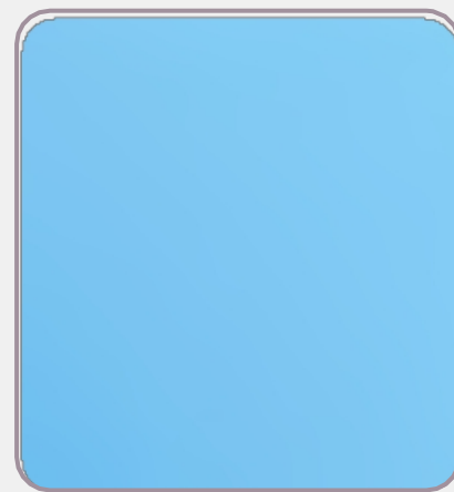
XPS 100 mm