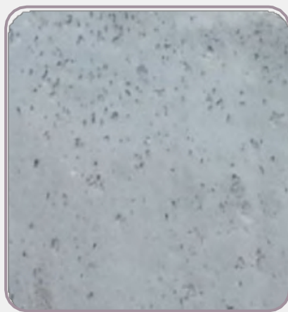
Foam block 150 mm