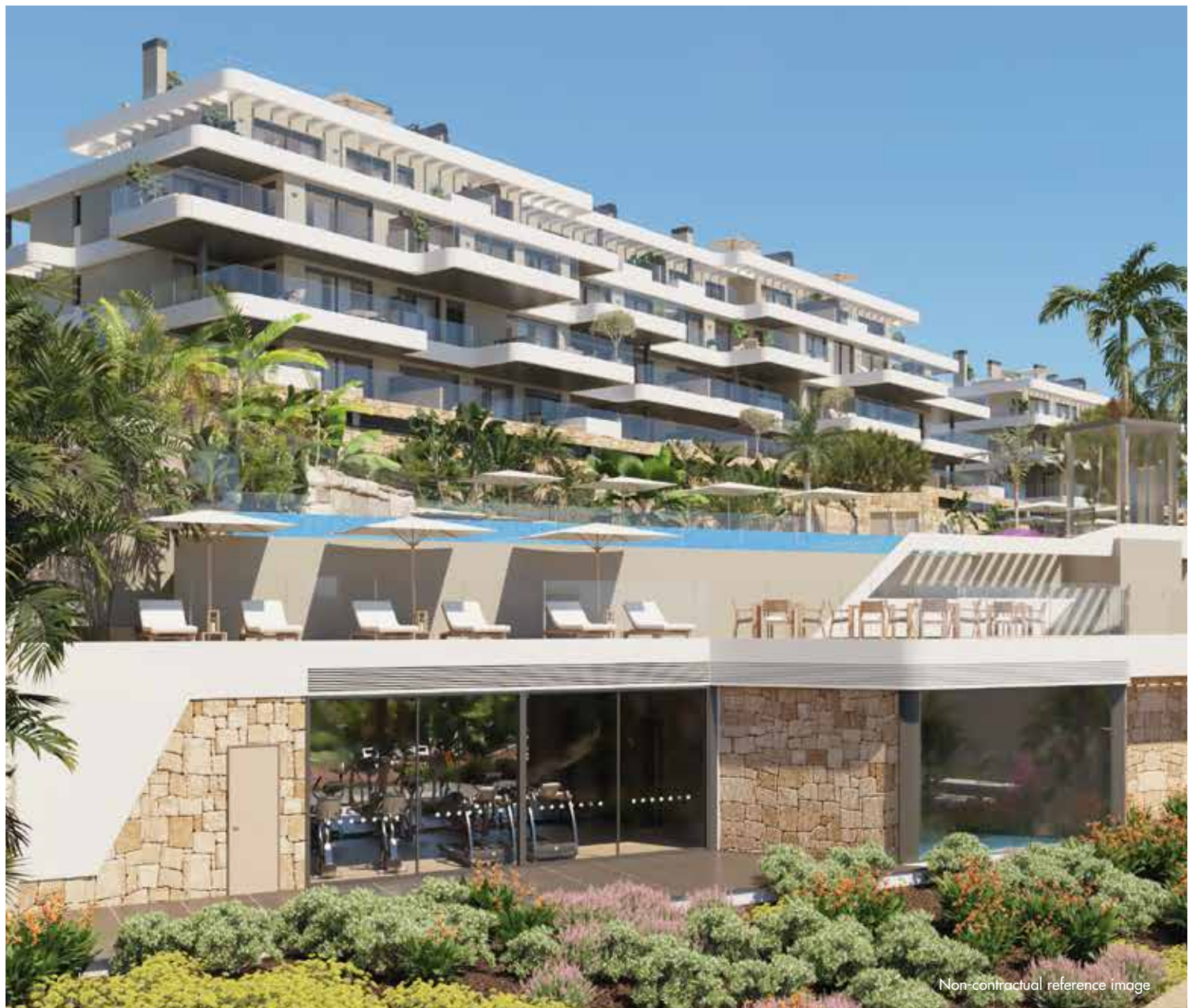
Non-contractual reference image