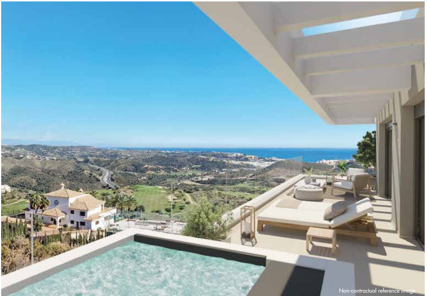
Non-contractual reference image