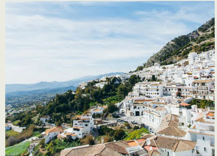
TRADITIONAL WHITEWASHED VILLAGE OF MIJAS PUEBLO