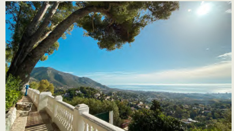
PANORAMIC VIEWS OF THE MEDITERRANEAN SEA AND THE COASTLINE BELOW