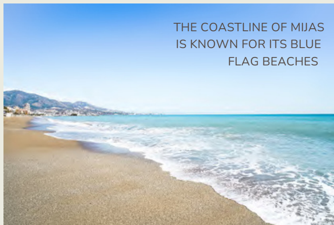
THE COASTLINE OF MIJAS IS KNOWN FOR ITS BLUE FLAG BEACHES