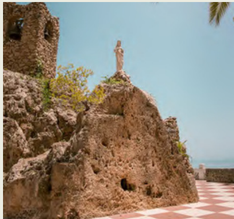
AUTHENTIC CHARM OF ANDALUSIA & ITS CENTURIES-OLD HISTORY