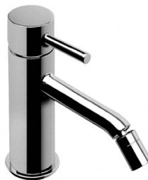
Icónico A-VE11 Bidet Faucet