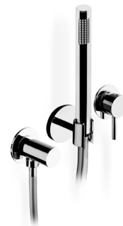
Icónico D2 Shower sink