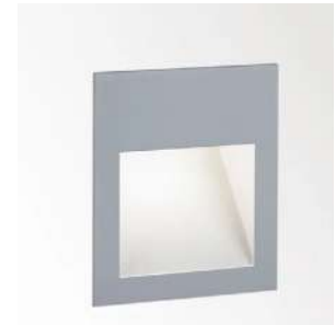
Deltalight Heli X Screen