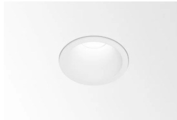
Deltalight Mini Deep Ringo