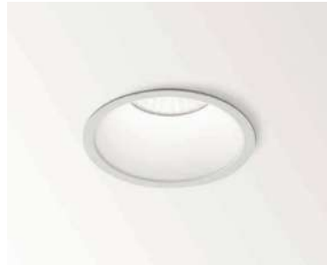
Deltalight Deep Varo