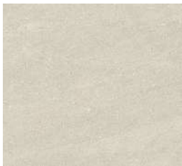
Ivory coloured porcelain floor 90x90 cm