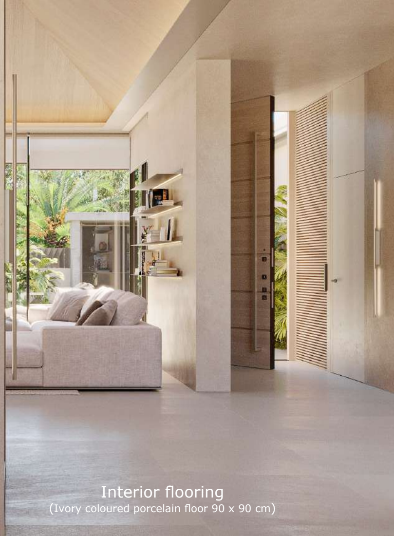
Interior flooring (Ivory coloured porcelain floor 90 x 90 cm)