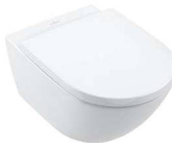
Villeroy & Boch suspended toilet 370 x 560 mm