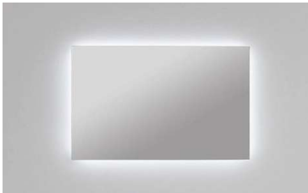
Backlit mirrors with concealed frame