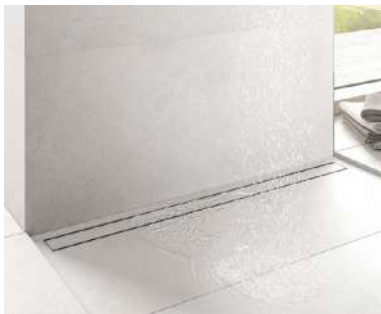
Shower drain line TECE