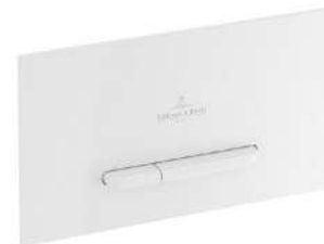
Villeroy & Boch imported flush system 280 x 160 x 16 mm.