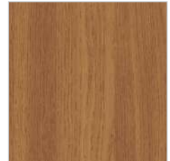
Oak finish panelling