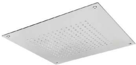
Shower head 400 x 400 mm Aqualite