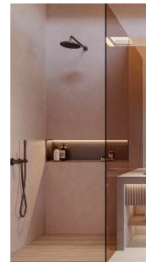
Tempered glass shower enclosures