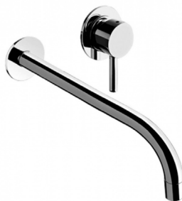
A-LP22 Sink Mixer