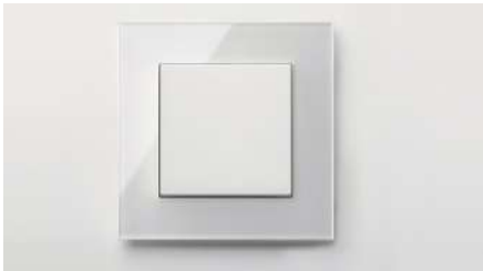
JUNG LS990 Matte White switch