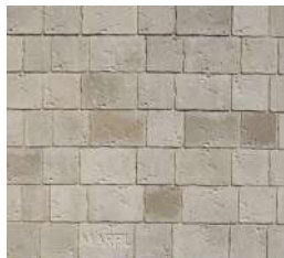
Granite paving stone