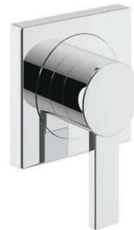
Grohe Allure Stop Valve