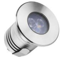
LED BOX LAND MINI lightin pool