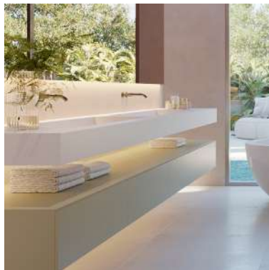
KRION SERIE RAS washbasins & vanity unit