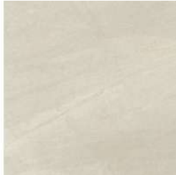
Ivory coloured porcelain floor